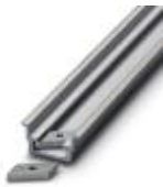
DIN rail, deep drawn, high profile, unperforated, 1.5 mm thick, material: aluminum, height 15 mm, width 35 mm, length 2000 mm

DIN rail, unperforated - NS 35/15 AL UNPERF 2000MM - 1201756