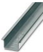
DIN rail 35 mm (NS 35)

DIN rail - NS 35/15 WH UNPERF 2000MM - 1204135