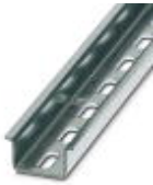
DIN rail 35 mm (NS 35)

DIN rail perforated - NS 35/15 WH PERF 2000MM - 0806602