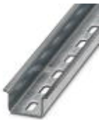
DIN rail, material: Galvanized, perforated, height 15 mm, width 35 mm, length: 2 m

DIN rail perforated - NS 35/15 ZN PERF 2000MM - 1206599