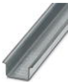
DIN rail, material: Galvanized, unperforated, height 15 mm, width 35 mm, length: 2 m

DIN rail, unperforated - NS 35/15 ZN UNPERF 2000MM - 1206586